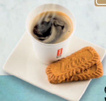
XL speculoos (2 Pcs)

Some enjoy the perfect match between coffee and Lotus Speculoos by dipping the biscuit in the coffee. Others take a bite and then sip their coffee.