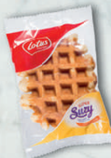
Lotus hot waffle